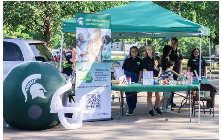
4-H Community Health Ambassadors share vaccine information at the Daniel Tiger Day Event in 2023.

To reach more young people with evidence-based vaccine education, MVP created a 4-H Community Health Ambassador program. The MVP ambassador program was made up of teens from across the state who were trained as peer educators for vaccine education efforts in their communities. Ambassadors in the program received training on youth leadership, vaccine education, and video and social media production. As part of this role, ambassadors designed, produced, and delivered educational videos, social media posts and workshops about the health benefits of immunizations and vaccinations.