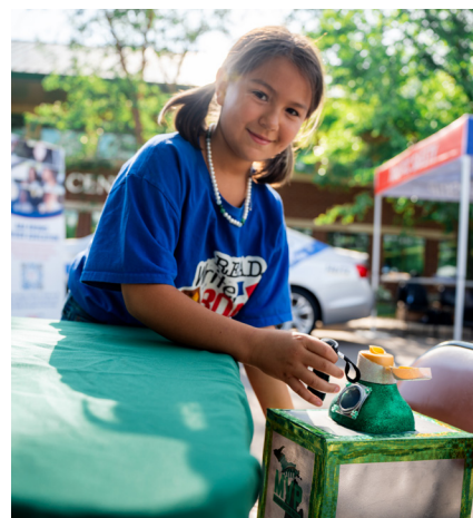
A youth participant uses the Germ-o-Scope 3000 to learn more about the spread of germs.

Additionally, the 4-H Youth Health Ambassador Program provided youth with opportunities to see a place for themselves in public health, both as professionals and engaged citizens. Outreach and education like that provided by MVP has the potential to save lives, prevent suffering, reduce stress on our healthcare system and lower the overall cost of medical care for Michigan communities.