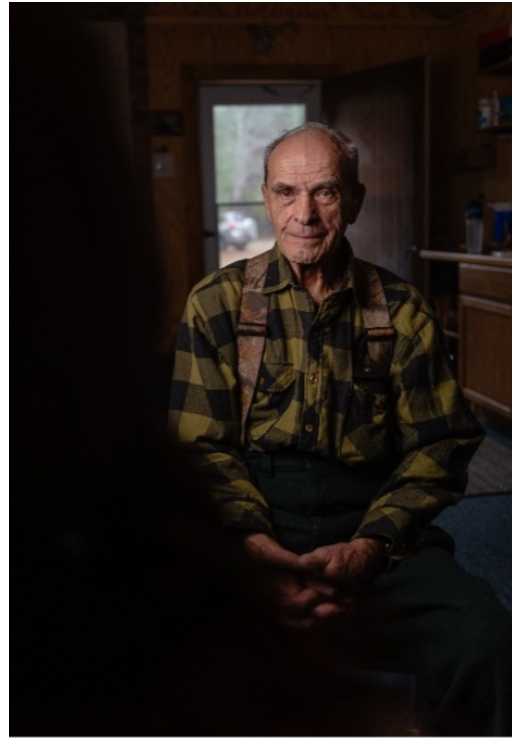
Photos of vaccine story interviewees.

The MVP team created 10 documentary videos that captured the experiences and motivations of everyday Michiganders who chose to get vaccinated and advocate for others to do the same. These stories included firsthand accounts from nurses who cared for COVID-19 patients during the height of the pandemic, as well as stories from a diverse group of people: a high school quarterback, an outdoorsman/retired state trooper, a community health ambassador, a farmer, a veteran, and an MVP team member who conducted outreach efforts on Beaver Island. These video stories were shared on social media, turned into radio and Spotify ads and transcribed for use in articles on the MVP website.